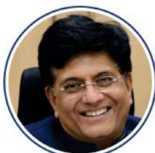
Shri Piyush Goyal Union Minister For Commerce & Industry, Consumer Affairs & Food & Public Distribution & Textiles, Govt. of India