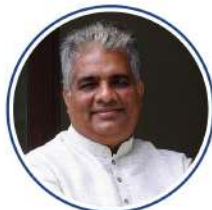
Shri Bhupender Yadav Union Minister For Environment, Forest & Climate Change & Labour & Employment Govt. of India