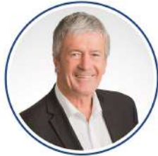
Hon Damien O'Connor Minister For Trade & Export Growth, Agriculture, Biosecurity, Land Information & Rural Communities, Govt. of New Zealand