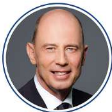
Mr. Wolfgang Tiefensee Minister For Economic Affairs, Science & Digital Society State of Thuringia, Germany