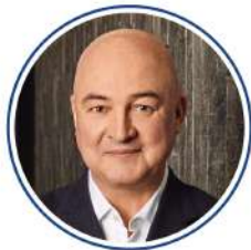
Mr. Alan Jope CEO, Unilever