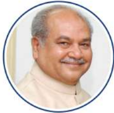
Shri Narendra Singh Tomar Union Minister For Agriculture & Farmers Welfare, Govt. of India