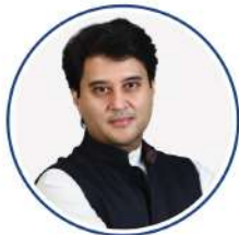
Shri Jyotiraditya Scindia Union Minister For Civil Aviation & Steel, Govt. of India