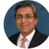
Dr. Anish Shah Vice President, FICCI & CEO & Managing Director, Mahindra & Mahindra Ltd.