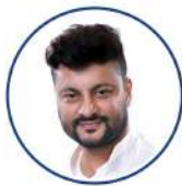
Shri Anubhav Mohanty Member of Parliament, Govt. of India