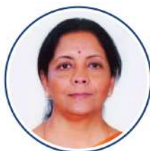
Smt. Nirmala Sitharaman Union Minister For Finance & Corporate Affairs, Govt. of India